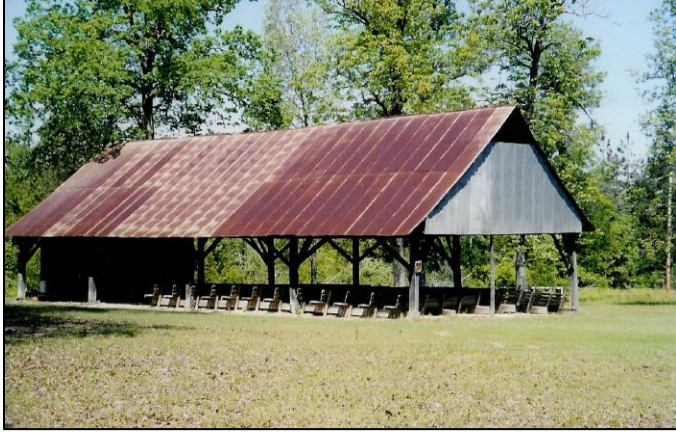
Camp Shed at Serepta Spring