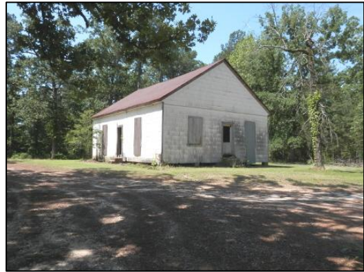
Friendship Church in 2013