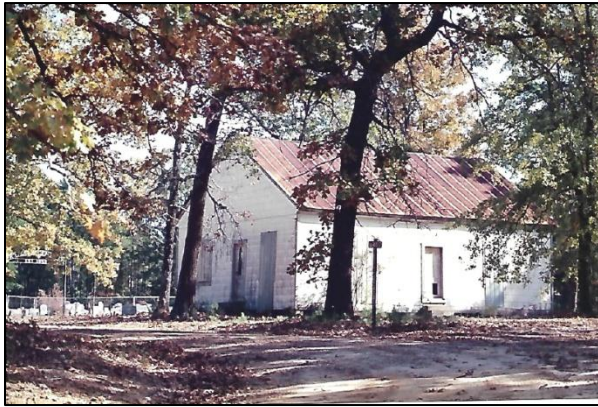
Friendship Church in 1993